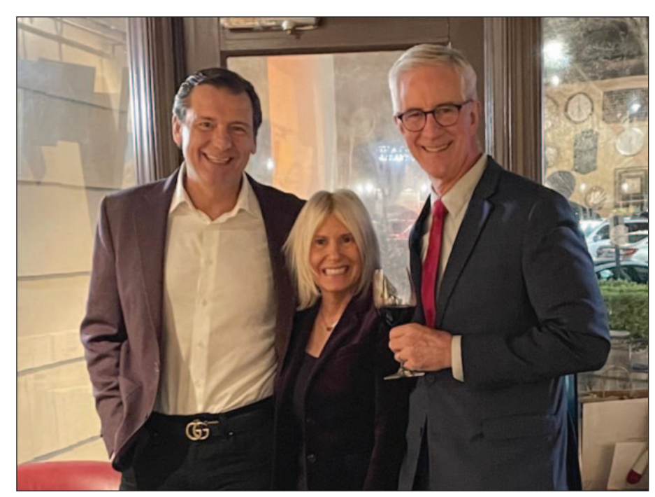
Greater Charlotte chapter members enjoyed networking at the chapter's annual wine and cheese raffle event.