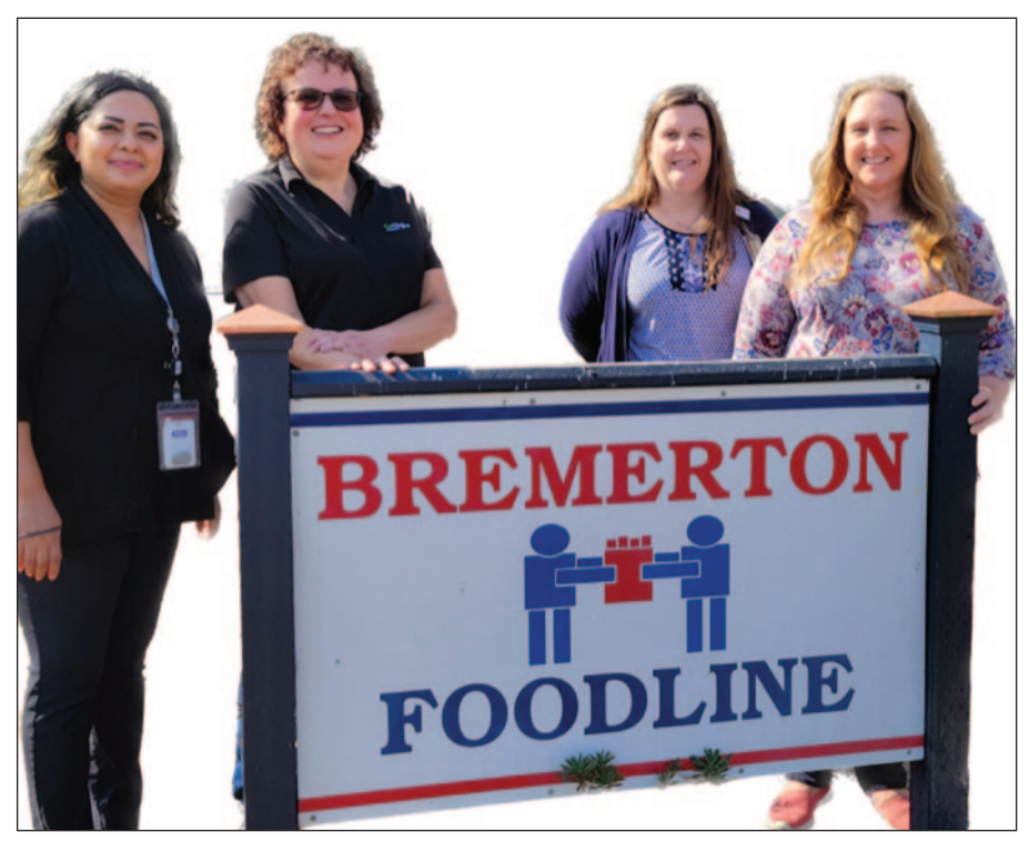
Pacific Northwest chapter members volunteered at the Bremerton Foodline on October 6, 2022.