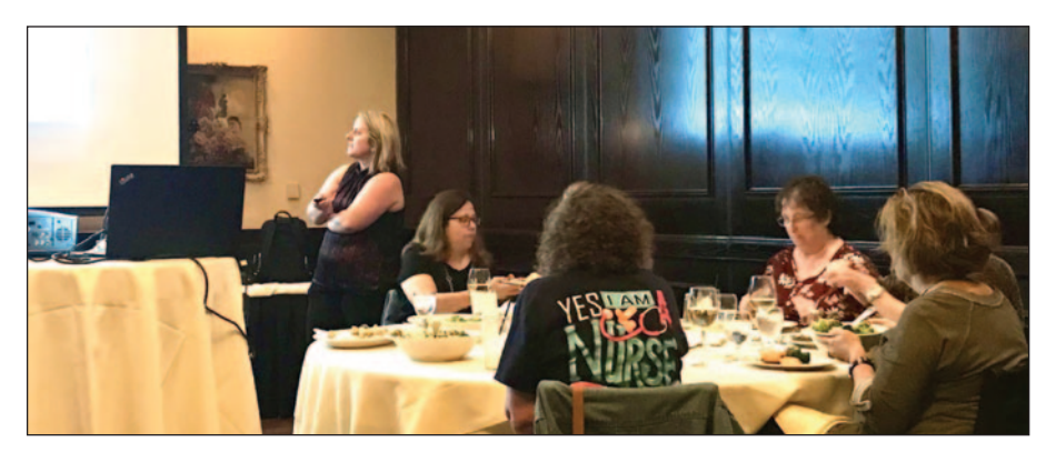
St. Louis chapter members gathered for an educational dinner on "Pruritus in Non-Dialysis-Dependent Chronic Kidney Disease" at Maggiano's Little Italy on October 10, 2022.