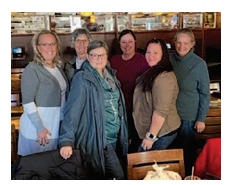
The Platte River chapter planning committee/executive committee held a business meeting at Kona Grill on November 20, 2022.

The chapter planning committee/ executive committee had a business