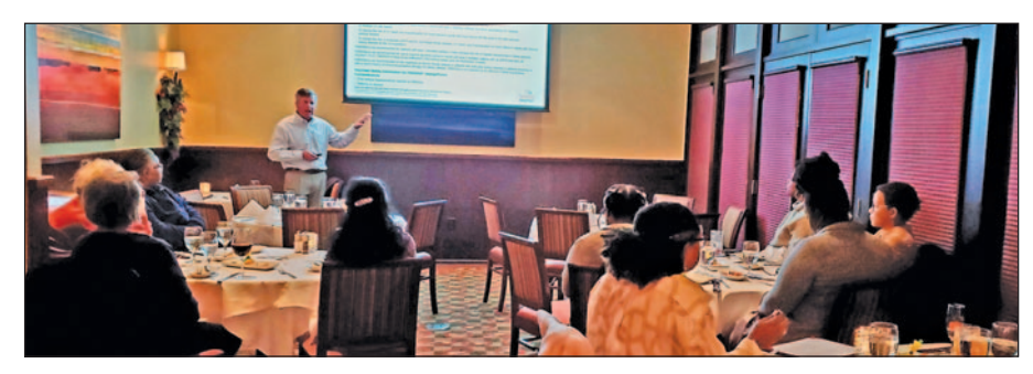
Cardinal chapter members gathered for a holiday dinner and business meeting at Ruth's Chris Steak House in Durham, NC, on December 1, 2022.