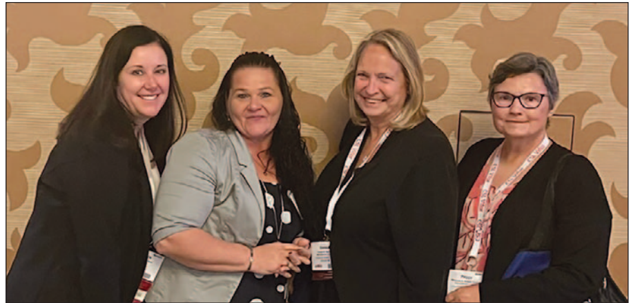
Members of the Platte River Chapter participated in an educational event.

Our chapter held another educational dinner presentation on October 20 with Rena Care.