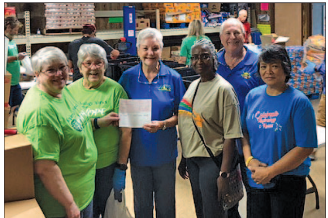
Members of the Hazel Taylor Chapter presented a donation check to the Alabama Childhood Food Solutions food bank.