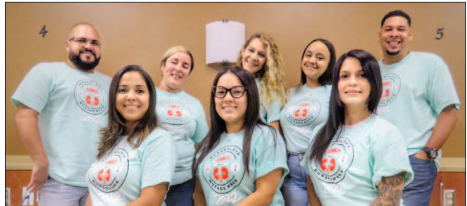
Caribbean chapter members and staff from the Fresenius Kidney Care Vega Alta dialysis center celebrated Nephrology Nurses Week.