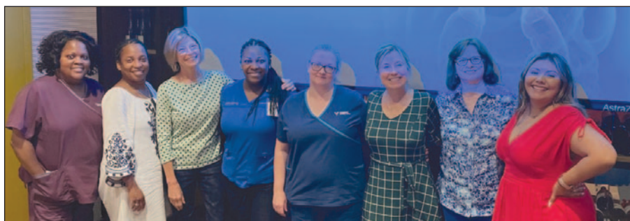
Members of the Greater Charlotte Chapter participated in an educational dinner sponsored by AstraZeneca.