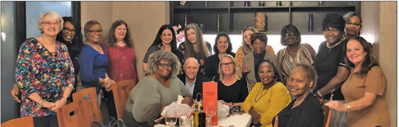
Members of the South Florida Flamingo Chapter celebrated Nephrology Nurses Week at Villagio restaurant in Coral Gables on September 15.