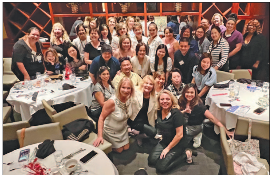
The Chumash Chapter celebrated Nephrology Nurses Week by hosting an educational dinner event about living kidney donation on September 13.

One of the highlights of September was Nephrology Nurses Week. The nurses at San Diego VA Dialysis center celebrated all week with “Nephrology Nurses Give HOPE” pens for everyone, daily raffles, and special recognition of our CNNs,