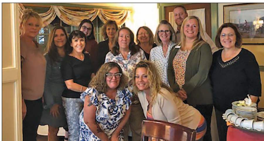
On September 21, the Northeast Tri-State Chapter hosted its first in-person program since the pandemic.