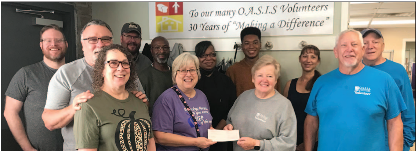
As part of the Feed Your Kidneys initiative, the St. Louis Metro Chapter presented a donation check to the Oasis Food Pantry in St. Charles, MO, on September 24.

We participated in the Feed Your Kidneys initiative. Our chapter volunteered on September 24 and presented our food pantry partner with a $1,500 donation provided by ANNA. Chapter members pitched in by providing food items for 40 taco dinner kits. Chapter volunteers sorted the food items into taco kits and shopped the pantry to fulfill individual client grocery lists. We enjoyed working with the Oasis Food Pantry. They have been feeding hungry neighbors for over 30 years.