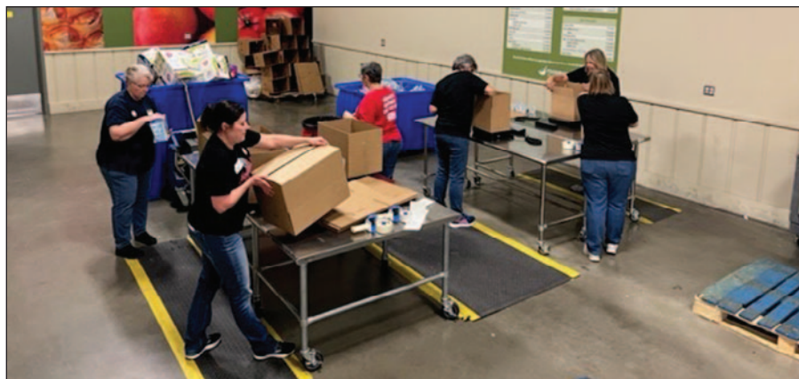
Members of the Platte River Chapter volunteered at a local food bank as part of the Feed Your Kidneys initiative.

We held our 9th Annual Education Day on September 15 at the Scott Conference Center at the University of Nebraska in Omaha. The meeting drew 42