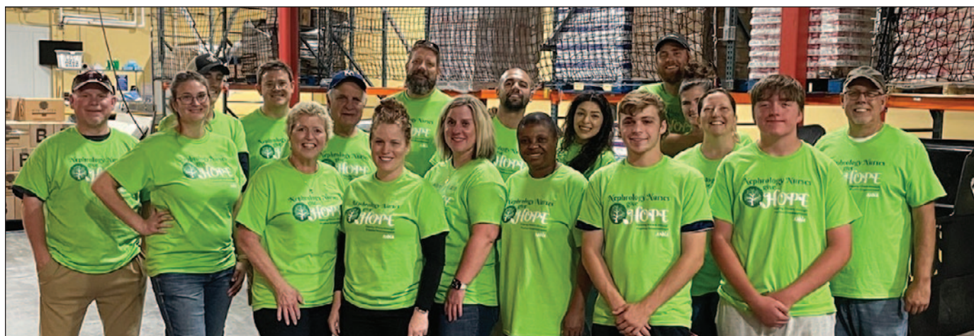
Members of the Heart of America Chapter recruited colleagues, family, and friends to work a shift at a local food bank.