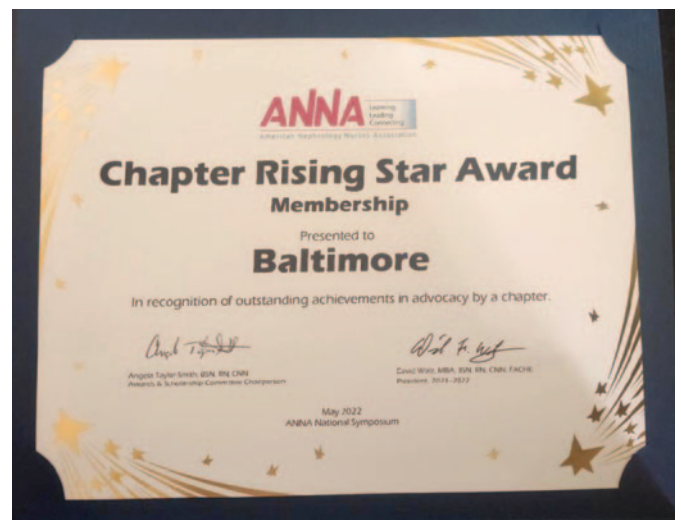
The Baltimore Chapter received the 2022 Chapter Rising STAR Award for Membership.

Our chapter won the 2022 Chapter Rising STAR Award for Membership and received $500. The funds will be used for providing educational meetings during the coming year.