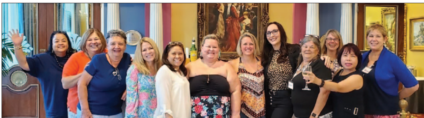
The Suncoast Chapter celebrated Nephrology Nurses Week with a cocktail reception.