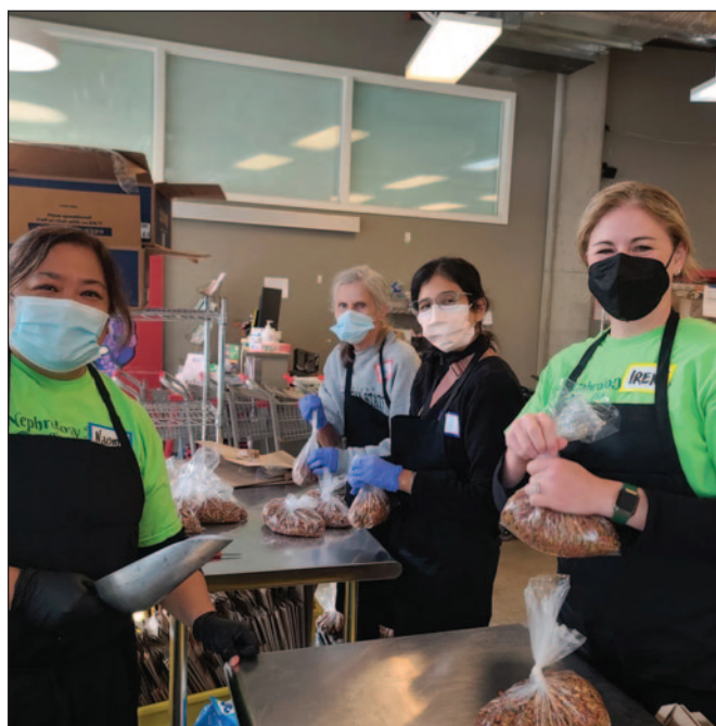
Pacific Northwest chapter members volunteered at a local food bank in support of the Feed Your Kidneys program.