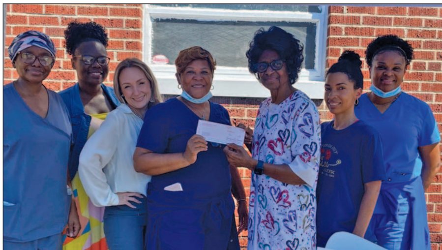
Members of the Magnolia Chapter presented a donation check to New Zion Healing Temple Pantry.