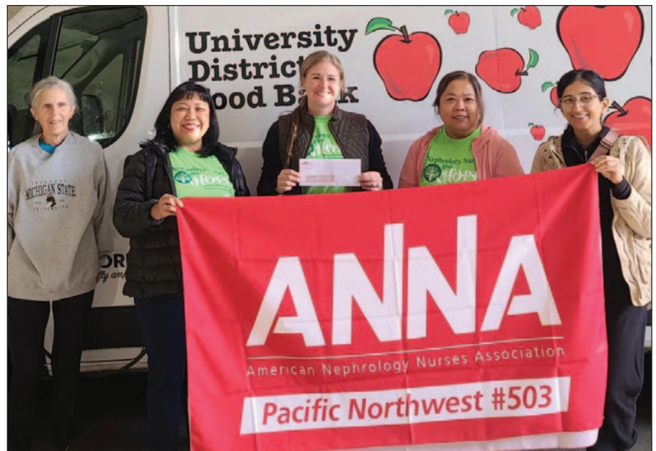
Pacific Northwest chapter members volunteered at a local food bank in support of the Feed Your Kidneys program.

dry food, and fragile items – and placed them in large bins. Many people volunteered at the food bank that day, and we worked beside a team from Delta Airlines. It was a great, rewarding day!