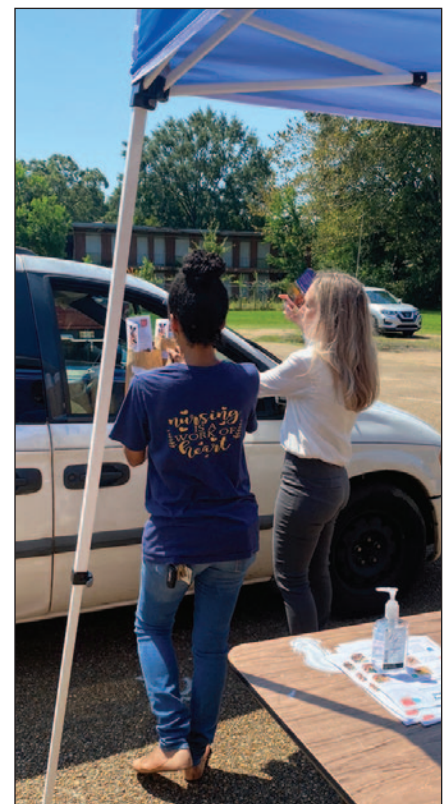
Magnolia chapter members helped distribute bag lunches at the New Zion Healing Temple Pantry.

Six chapter members volunteered at New Zion Healing Temple Pantry in September as part of the Feed Your Kidneys