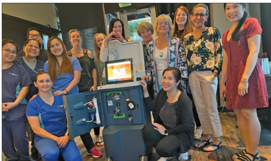
High Country chapter members attended a dinner meeting featuring the Tablo hemodialysis machine.

dietitians, and social workers attended. It was a great opportunity to learn, network, and have fun. All attendees received kidney pins with their birthday gemstone, and some left with raffle prizes.