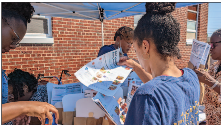
Magnolia chapter members helped assemble bag lunches and included handouts with information on healthy eating for community residents.