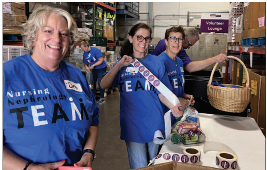
Desert Vista chapter members volunteered at Desert Mission Food Bank and helped restock "senior packs."

We will start off the new year with a dinner meeting supported and provided by