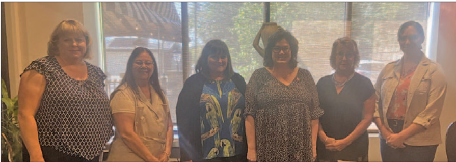
The Three Rivers Chapter hosted a lunch and learn event in September.