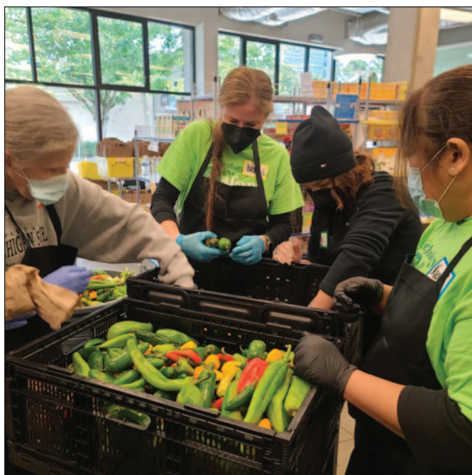
Pacific Northwest chapter members volunteered at a local food bank in support of the Feed Your Kidneys program.