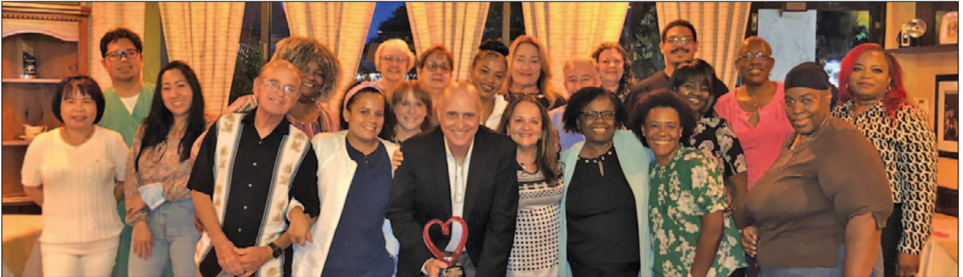
South Florida Flamingo chapter members celebrated Nephrology Nurses Week at Cafe Vico in Fort Lauderdale on September 13.

hosted a meeting on High-Potency Phosphate Binding to Activate Control with Velphoro® at Perry's Steakhouse and Grille. Attendees enjoyed the evening and learned new information.