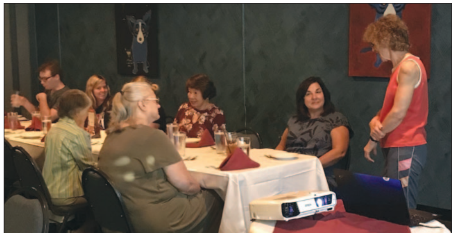
Members of the St. Louis Metro Chapter participated in an educational dinner on CKD-associated pruritis in Springfield, IL, on August 25.

Our chapter held an educational event at St. Joseph Hospital on October 13.