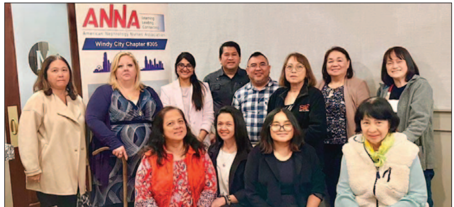
Members of the Windy City Chapter gathered for a fall educational meeting on "Major Depressive Disorder in CKD."

During our meeting, we held a raffle and donated $150 to our Feed Your Kidneys partner, All Kidney Patient Support Group (AKPSG). We had a speaker from this group and discovered that she was a dialysis patient who had several transplants and realized during her journey that at the end of the month many of the patients in her clinic had to choose between buying medications or food. After her last transplant, she founded AKPSG, which helps to meet the need for food each month. If you would like to help AKPSG, volunteers meet on the third Monday of each month to pack food boxes and on the third Tuesday of each month to finish packing refrigerated items and distribute the food boxes to patients. Food is distributed at the end of the month