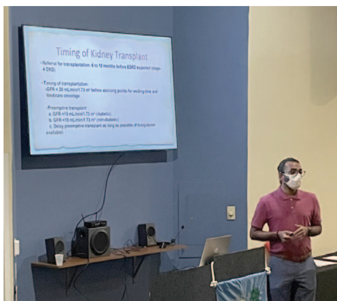
The Suncoast Chapter hosted a successful annual meeting with expert speakers presenting on a variety of topics.