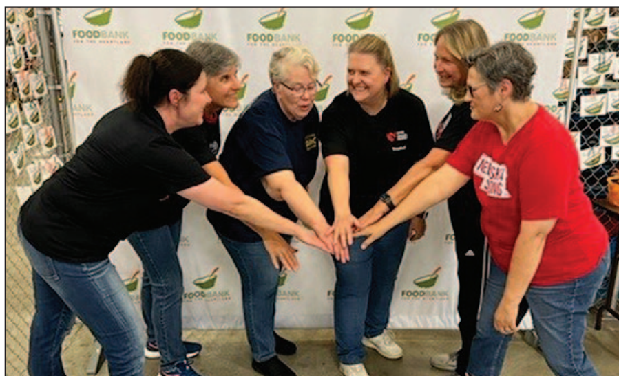
Members of the Platte River Chapter volunteered at a local food bank as part of the Feed Your Kidneys initiative.