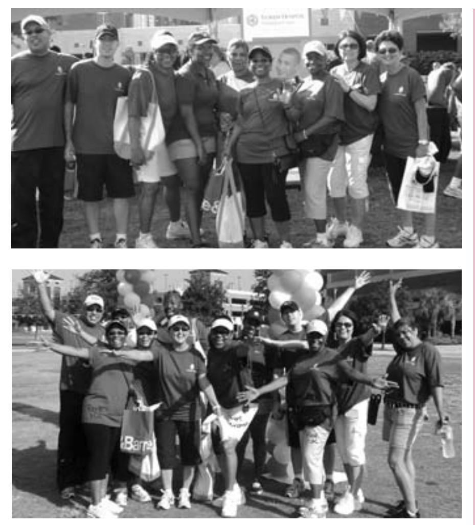
Members of the Sunshine Central Chapter participated in the NKF's inaugural Kidney Walk in Orlando, FL