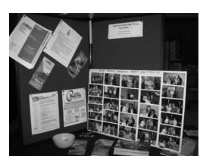
South Florida Flamingo chapter members participated and hosted a booth at the Florida Nurses Association Symposium in Ft. Lauderdale.