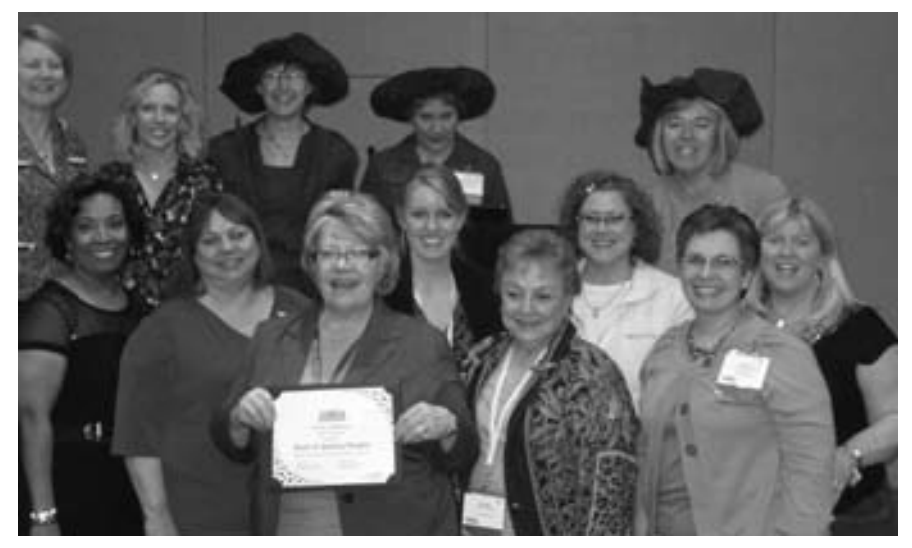
The Heart of America Chapter received the North Central STAR (Successful Teamwork = Achievements and Recognition) Award at the National Symposium in Boston.

ing in September. Watch for further information! This should be a spectacular meeting in a special location. Also, we anticipate a very special guest speaker at this meeting.