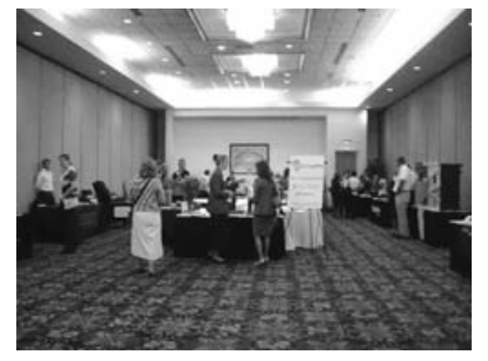
The North Carolina Annual Statewide Symposium featured an exhibit hall.