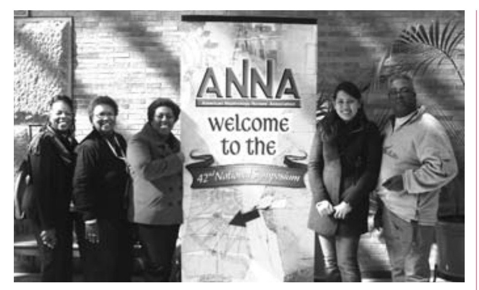
South Florida Flamingo chapter members enjoyed networking while attending the National Symposium in Boston.

Chapter officers met at Dade Dialysis on May 12 to plan for upcoming educational seminars, KDAE Week, and Nephrology Nurses Week. An educational meeting was held during the month of June. Plans are also underway for a review course to be offered some time during the fall.