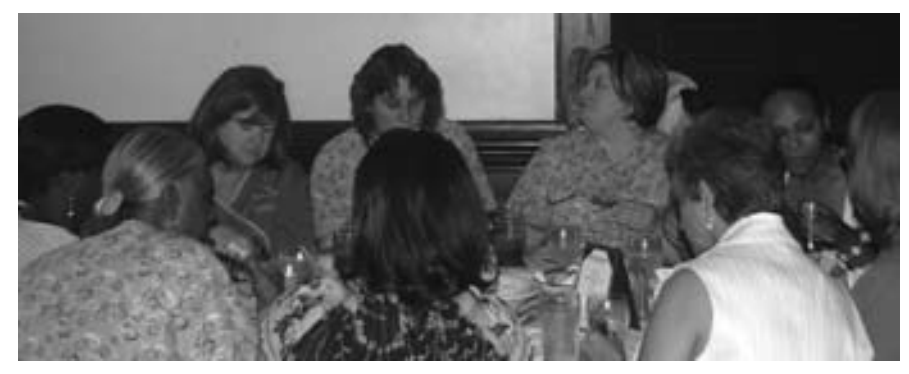
Dogwood chapter members and friends recently gathered for a celebration and educational meeting at Maggiano's in Atlanta.