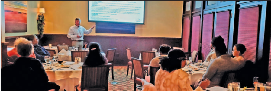
Cardinal chapter members gathered for a holiday dinner and business meeting at Ruth's Chris Steak House in Durham, NC, on December 1, 2022.