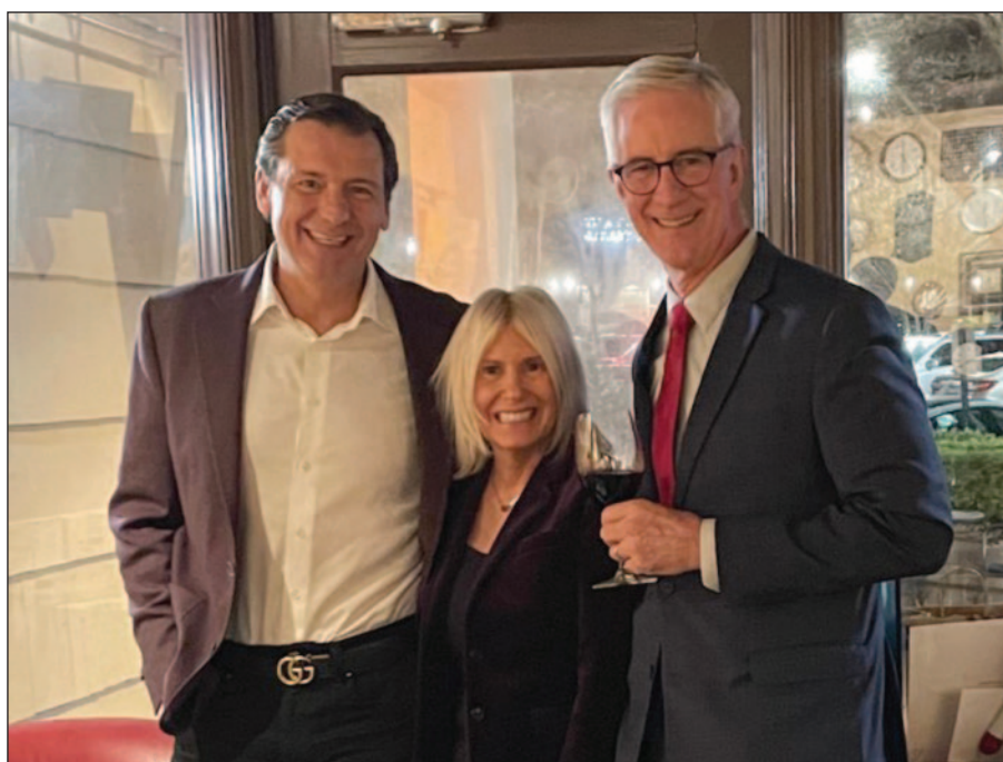
Greater Charlotte chapter members enjoyed networking at the chapter's annual wine and cheese raffle event.