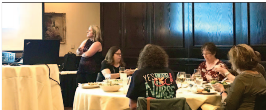
St. Louis chapter members gathered for an educational dinner on “Pruritus in Non-Dialysis-Dependent Chronic Kidney Disease” at Maggiano’s Little Italy on October 10, 2022.