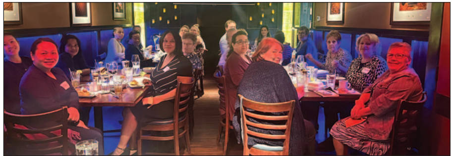
Desert Vista chapter members enjoyed an educational program on gastroparesis at the Phoenix City Grille on October 20, 2022.

Chapter members gathered at the Phoenix City Grille on October 20, 2022, for an educational program presented by Patient Care America. The topic was Gastroparesis , and the program offered 1.0 contact hour. The chapter welcomed nonmembers from our community and sponsored their membership in ANNA. Welcome to our new recruits! Several prize drawings also were held during our meeting. Attendees had the opportunity to learn, network, and socialize.