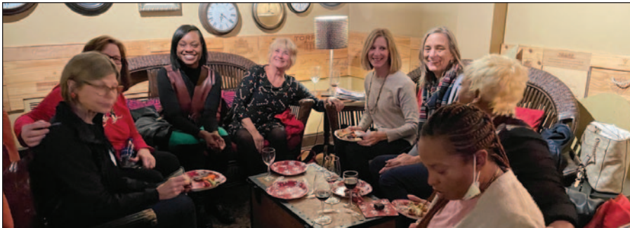
The Greater Charlotte Chapter hosted its annual wine and cheese raffle at the Wine Vault.