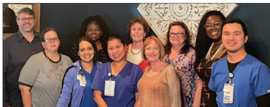
Palmetto chapter members participated in an educational dinner sponsored by GlaxoSmithKline on October 27, 2022.