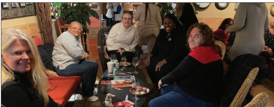
Members of the Greater Charlotte Chapter gathered at the Wine Vault for the chapter's annual wine and cheese raffle.