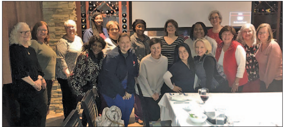
Members of the Hazel Taylor Chapter gathered for a dinner meeting on December 1, 2022.

Watch for information about upcoming chapter meetings. If you have a suggestion for a topic or location, please contact a chapter officer.