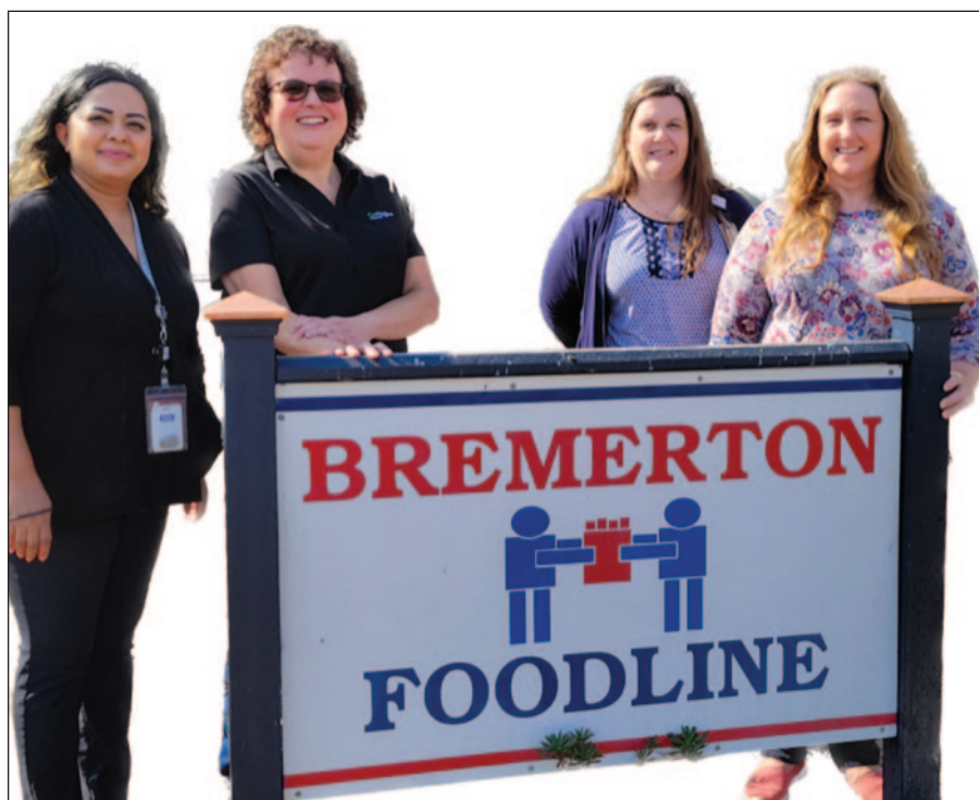
Pacific Northwest chapter members volunteered at the Bremerton Foodline on October 6, 2022.